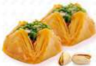
Pistachio Pyramid(Topping) ₹70/- per piece