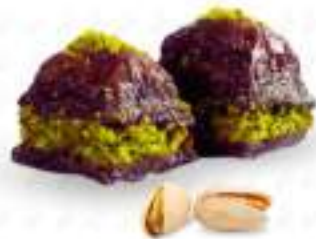
Chocolate Pistachio ₹80/- per piece