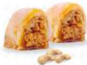
Cashew Kitta ₹45/- per piece