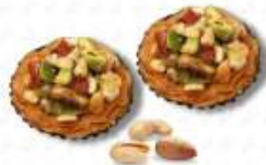
Mix Nut Tart ₹60/ per piece