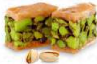
Pistachio Asiyah ₹80/- per piece