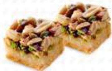
Mix Nuts Linza ₹80/- per piece