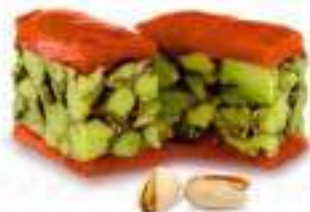
Mor Pistachio Asiyah ₹90/- per piece