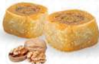
Walnut Saray ₹70/- per piece