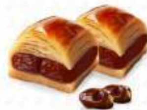
Date Baklava ₹60/- per piece