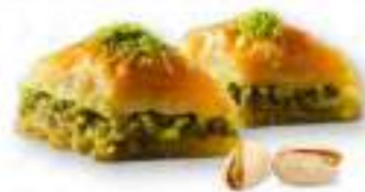
Diamond Pistachio ₹70/ per piece