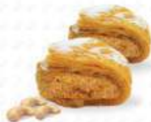
Cashew Rosebud ₹45/- per piece