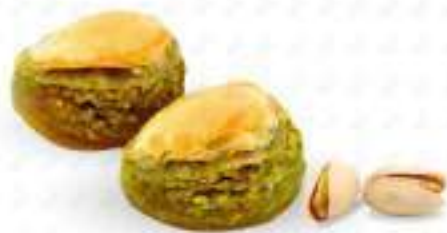
Pistachio Dilber Dudagi ₹70/- per piece