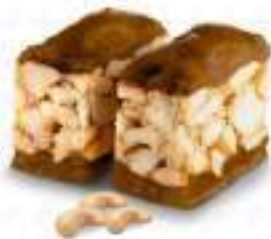
Chocolate Cashew Asiyah ₹70/- per piece