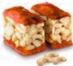
Mor Cashew Asiyah ₹70/- per piece