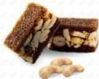
Chocolate Cashew Ballouria