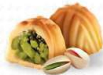
Pistachio ₹70/- per piece