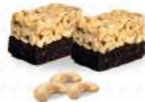
Chocolate Cashew Kadayif