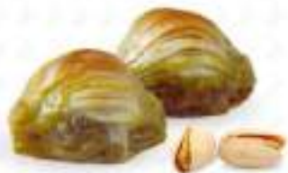
Turkish Pistachio Midye ₹90/- per piece