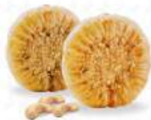
Cashew Ring ₹50/- per piece