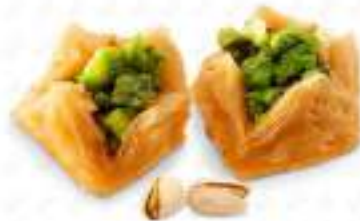
Pistachio Pyramid ₹70/- per piece