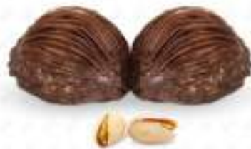
Chocolate Pistachio Midye ₹100/- per piece