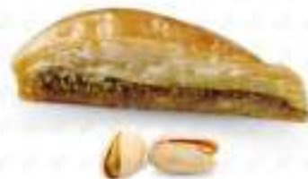
Pistachio Carrot Baklava ₹200/- per piece