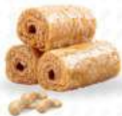
Cashew Finger ₹40/- per piece