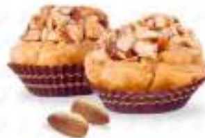
Almond Tart ₹60/ per piece