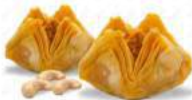
Cashew Pyramid ₹50/- per piece