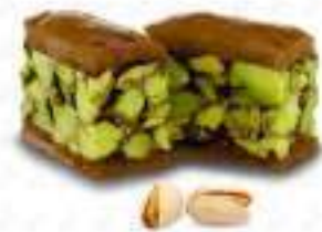
Chocolate Pistachio Asiyah ₹90/- per piece