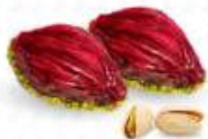
Mor Pistachio Midye ₹90/- per piece