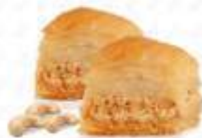
Cashew Baklava ₹40/- per piece