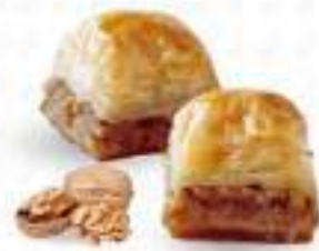
Classic Walnut Baklawa ₹80/- per piece