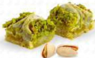
Pistachio CimCik ₹60/- per piece