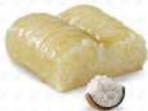
Coconut Durum ₹60/- per piece