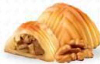
Walnut ₹60/- per piece