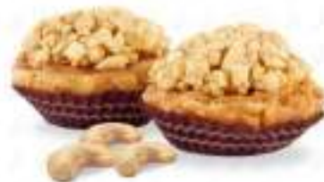
Tart Cashew ₹60/ per piece