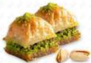
Classic Pistachio ₹80/- per piece