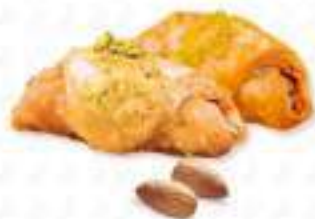
Almond Crosole ₹40/- per piece