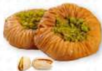
Pistachio Ring ₹70/- per piece