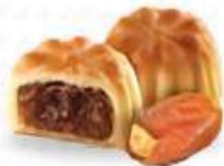
Date ₹60/- per piece