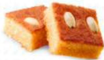
Basbousa ₹60/- per piece