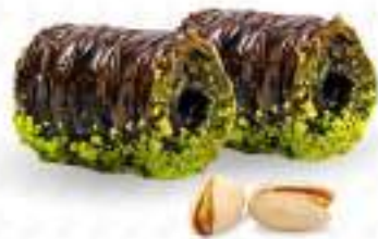
Chocolate Pistachio Durum ₹70/- per piece