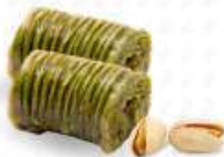
Double Pistachio Durum ₹70/- per piece