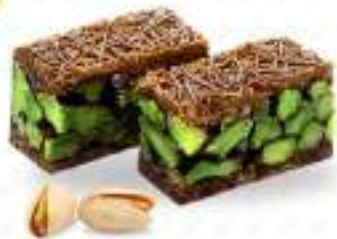
Chocolate Pistachio Ballouria