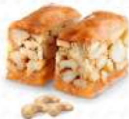
Cashew Asiyah ₹70/ per piece