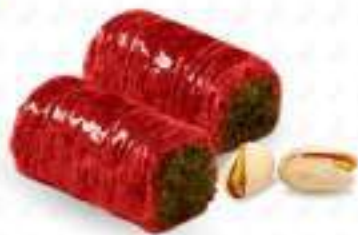
Mor Pistachio Durum ₹70/- per piece