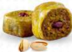
Double Pistachio Saray ₹70/- per piece