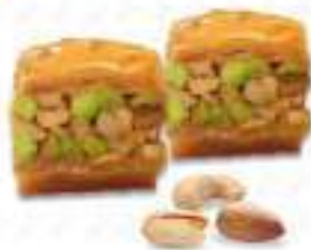
Special Baklawa ₹60/- per piece