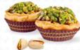
Pistachio Tart ₹75/ per piece