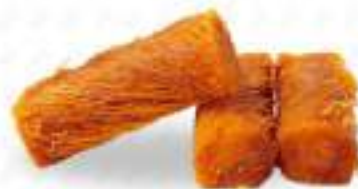
Sade Kadayif Finger