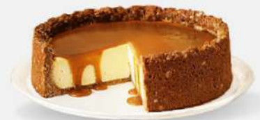
Salted Caramel Cheesecake

Creamy pistachio delight, decadent cheesecake with nutty perfection.