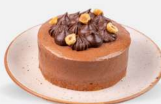
Choco Hazelnut Bento Cake

Unicorn-shaped cake, vibrant colors, enchanting design.