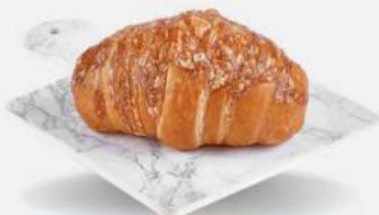
Caramel Almond Crossaint

Crispy fried dough sticks, coated in cinnamon sugar perfection.