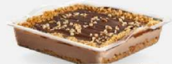
Chocolate Walnut Kunafa

Mango Cookie Kunafa: Sweet fusion delight with fruity, crunchy, Middle Eastern flair.