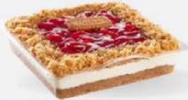
Cherry Lotus Kunafa

Sweet, flaky pastry with cherries, lotus spread; a delightful treat.