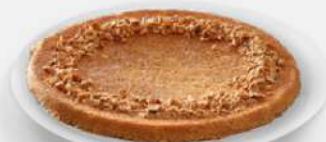
Bassma Walnut Kunafa Kashta

Rich fusion Baklava meets cheesecake, a symphony of sweet indulgence.