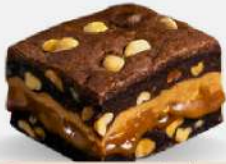
Peanut Caramel & Cookie Brownie Sandwich

Brownie filled with peanut caramel and cookie goodness, irresistible indulgence.