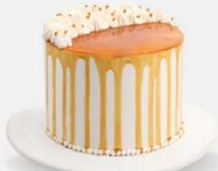
Tall Boy Butter Scotch

Rich espresso-infused layers, decadent coffee frosting – Tall Boy delight!