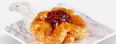
Cherry Marmalade Danish Pastry

Flaky layers enveloping rich hazelnut filling, crowned with luscious Nutella swirls.