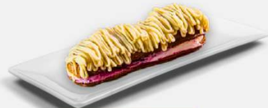
Vanilla Berry Eclairs

chocolate tart: rich, velvety, indulgent, with a buttery crust.