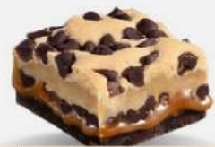
Choco-chip Cookie Dough & Caramel Brownie Sandwich

Decadent brownie sandwich with salted caramel, chocolate overload bliss.