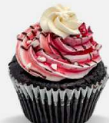
Blueberry Choco CupCake

Heavenly vanilla delight with a sprinkle of joy, a festive treat enchanting palates.