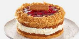
Strawberry Lotus Kunafa Cake

Rich walnut kunafa filled with creamy kashta, a luscious dessert.