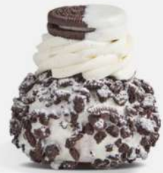
Vanilla Cookie Cream

Crispy Cherry Chocolate Crust, Chocolate Flakes, Mascarpone, Ripe Cherry