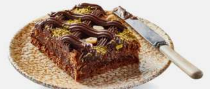
Madlouka Choco Trouifle

Sweet fusion delight Kunafa Kashta Cheesecake, rich, creamy, indulgent perfection.