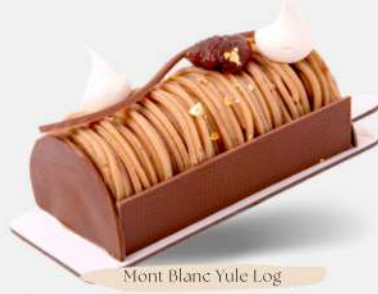
Mont Blanc Yule Log

Chocolate Cream, Biscotto praline, whipped cream and caramel cookie crumble