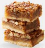
Honey Nut Bar Cookies

Crunchy, sweet, nutty bars with honey, perfect for delightful snacking.