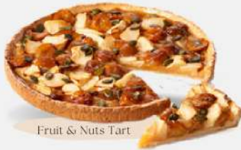
Fruit & Nuts Tart

fruit & nut tart: buttery crust, luscious fruits, crunchy nuts, a sweet symphony in every bite.