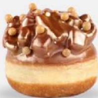
Toffee Butter Scotch

Mascarpone cream, Pistachio Dredge, Java Plum Filler & white chocolate.