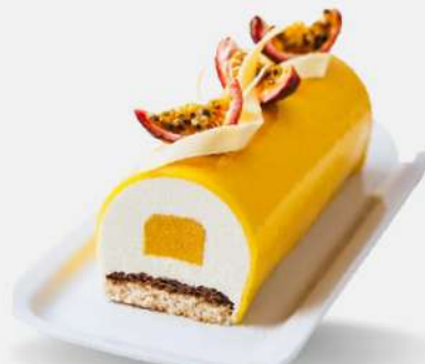
Passion Coco Yule Log

chocolate, strawberry-infused Yule cake: festive, rich, and irresistible delight.