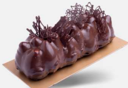
Almond Chocolate Trio Yule Log

Yule Log: Rich chocolate, velvety cream, festive indulgence embraced warmly.