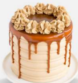
Tall Boy Salted Caramel

Rich espresso-infused layers, decadent coffee buttercream, a Tall Boy delight.