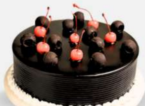
Death By Chocolate

chocolate flakes cake rich, moist, and utterly indulgent delight.