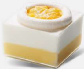
Qube Crème de Mangue

Luscious blueberry cake with a delightful, sweet and moist texture.