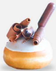
Dolce fleur de Sel

Chantilly cream, coconut shavings, passion fruit coconut cream and Cranberry Slices