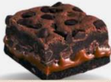
Double Choco-chip Caramel Brownie Sandwich

Goosey caramel, rich brownie, sandwiched with choco-chip cookie dough delight.