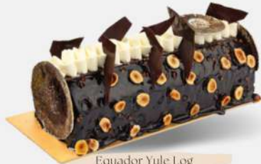
Equador Yule Log

Banoffee Yule Log: Caramel, banana, cream, blissful holiday delight.