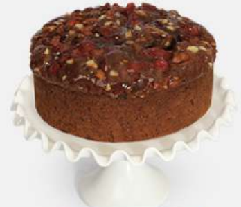
Date & Walnut

Moist vanilla butter cake, tender crumb, delightful simplicity in every slice.