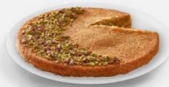
Bassma Pistachio Kunafa Kashta

Layers of chocolate cake, pudding, whipped cream—decadent, indulgent dessert delight.