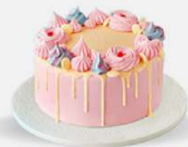
Unicorn Bento Cake

pineapple bento cake sweet, moist, tropical delight in every bite.