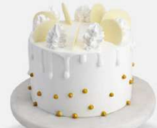
Tall Boy Vanilla

Rose-infused cake with luscious cream layers, a towering delight.