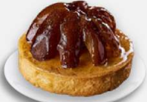
Date Caramel Tart

Date caramel tart: rich, sweet, indulgent, a sublime dessert delight.