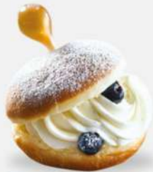
Honey Boston Cream

Blueberry & white Chocolate glacé, coconut and Black Currants