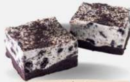
Oreo Fudge Bar

Goey cookie dough delight with rich chocolate chips in every bite.