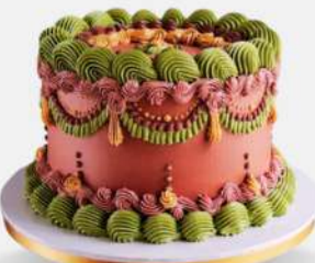
Tall Boy Filter Coffee

vanilla cake, towering layers, rich flavor, irresistible indulgence.