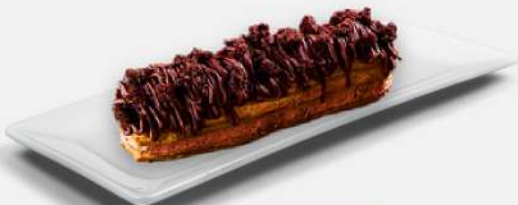
Double Chocolate Crumble Eclairs

eclairs filled with vanilla cream and mixed berry compote.