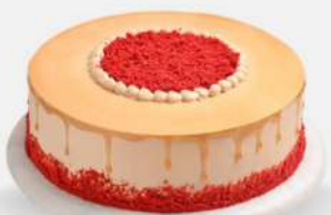
Caramel Red Velvet

Ferrero Rocher Cake: Nutty, chocolatey layers, pure indulgence in every bite.