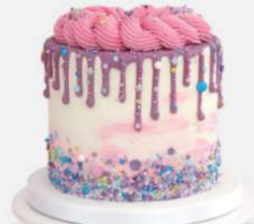
Tall Boy Rose Creme'

Tall Boy Strawberry cake sweet, moist, bursting with strawberry flavor.