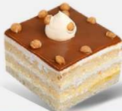
Qube Forêt noire

mango-flavored luscious, creamy, and irresistibly indulgent