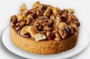
Caramel Nuts Tart

Mars Chocolate Tart: Rich, luscious, indulgent, heavenly delight in every bite.