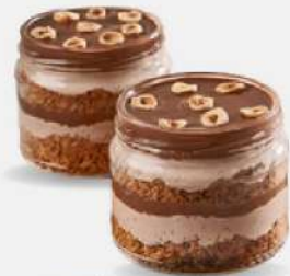
Nutella Kunafa Jake

Creamy Arabic dessert, flavored with rose or orange blossom water.