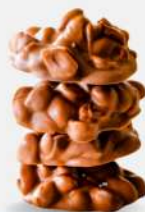
Caramel Pecan Chocolate

Assorted nuts, dried fruits atop chocolate discs – a delectable confection.