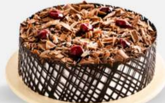
Black Forest Tudor

Sweet pineapple cake with moist layers and tropical flavor delight.