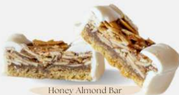
Honey Almond Bar

Crunchy almond-chocolate cookies with lacy caramel coating; irresistible indulgence.