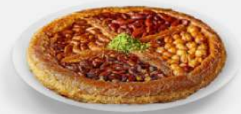
4 Seasons Kunafa

Rich pistachio kunafa with kashta, a decadent Middle Eastern delight.