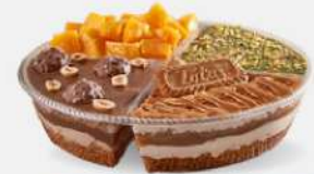
4 Season Ottoman Pudding

chocolate, Kunafa, custard; a blissful, indulgent dessert delight.