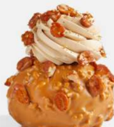
Dulcey Peanut Caramel

Chocolate ganache and praline, hazelnuts and chocolate crust, milk chocolate Chantilly and gianduja flakes