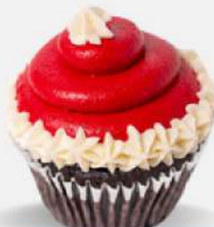
Santa Maria CupCake

Rich chocolate base, creamy filling, topped with luscious frosting, a heavenly delight.