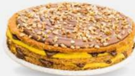
Chocolate Kunafa Custard Cake

Chocolate truffle Kunafa cake: rich, luscious layers, irresistible indulgence.