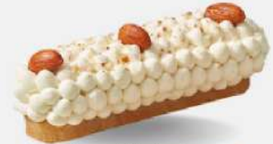
Almond Florian Pie

Delectable fusion: Mango, cheese, kunafa create irresistible tart indulgence.