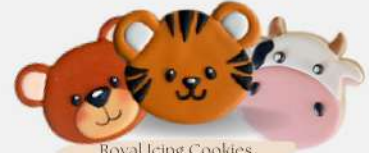
Royal Icing Cookies

Brookies: Fusion delight, combining brownies and cookies in one treat.