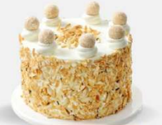
Tall Boy Almond Raffaello

Layers of moist cake, rich salted caramel indulgence. Irresistible!