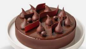
Brownie Chocolate Opulence

Rich Dark Chocolate cake infused with luscious cherries, a heavenly indulgence.