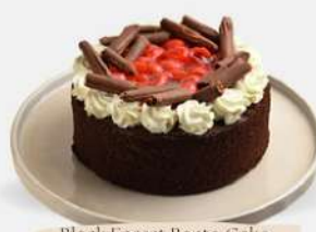
Black Forest Bento Cake

Dark chocolate bento cake rich, moist, indulgent delight.