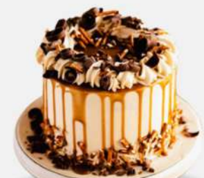
Tall Boy Almond Raffaello

Decadent layers of moist cake with rich salted caramel filling.