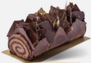
Banoffee Yule Log

Tokyo Yule Log: Matcha-infused sponge, red bean, delicate cream.