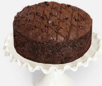
Double Choco Chip

Moist banana walnut cake with a hint of natural sweetness.