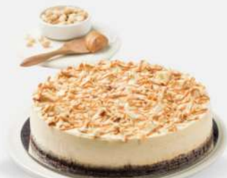
Hazelnut Caramel Cheesecake

Creamy Lotus Biscoff cheesecake with irresistible cookie crust and decadent filling.