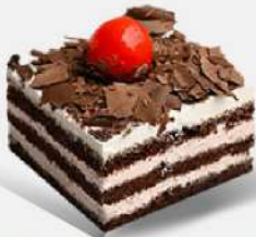
Qube Crème de Mangue

Myrtille Qake: Blueberry bliss, moist texture, heavenly indulgence in every bite.