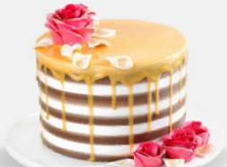
Tall Boy Filter Coffee

Rich espresso-infused layers, decadent coffee frosting – Tall Boy delight!