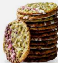
Pistachio Florentine Lace Cookies

Crunchy granola meets sweet berries in a delightful cookie treat.