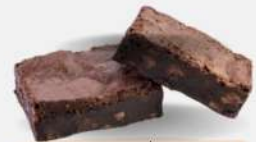
Brownie Fudge Bar

Rich Oreo Fudge Bar: Decadent layers, creamy bliss, irresistible indulgence.