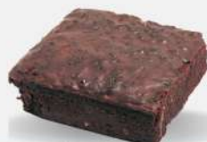
gooey Chocolate Brownie

Decadent brownie embraced in rich, velvety dark chocolate coating.