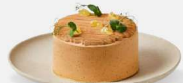
Coffee Mint Bento Cake

passion fruit bento cake: sweet, tropical, delightful indulgence in every bite.