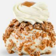
Gold cookie cream

Pistachio mascarpone ganache, Vanilla whipped cream & Pistachio Praline