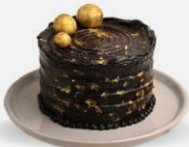
Dark Choco Bento Cake

coffee bento cake rich, aromatic, and visually delightful treat.