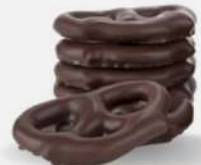
Dark Chocolate Pretzel

Crunchy pistachio delight caramelized sweetness, nutty perfection, irresistible treat.