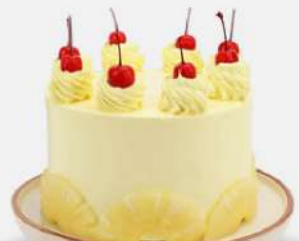
Tall Boy Pineapple Gateau

Elegant layers of white forest cake, a towering indulgence delight.