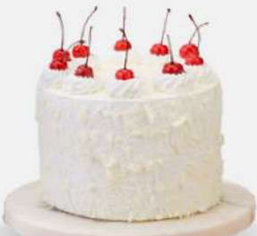
Tall Boy White Forest

Almond cake with layers of tall, creamy Raffaello indulgence.