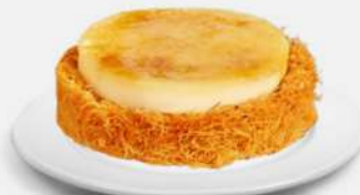
Kunafa Kashta Cheese Cake

Egyptian bread pudding dessert with nuts, raisins, and pastry layers.