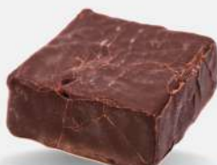
Dark Chocolate Enrobed Brownie

Rich chocolate fudge, crunchy walnuts, moist brownie perfection in every bite.