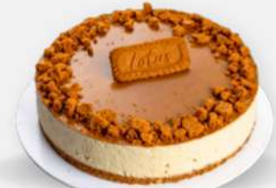
Lotus Biscoff Cheesecake

chocolate sponge with oreo buttercream filling, topped with cookie crumble.