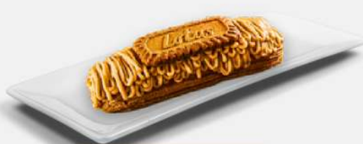
Lotus Biscoff Eclairs

rich chocolate-filled eclairs with a delightful crumbly double-chocolate topping