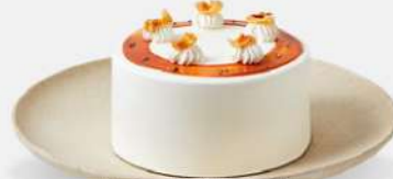
Passion Fruit Bento Cake

Biscoff bliss: layered cake, caramel swirls, crunchy bites, sweet perfection.