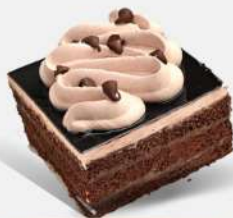
Qube Crème du Caramel

Qube Fraise Qake Intense fruity adventure, quake-style action in blocky world.