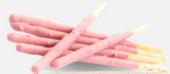
Chocolate Coated Pretzel Sticks

Salty, twisted dough, baked to golden perfection, a timeless snack.