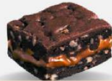
Walnut & Caramel Brownie Sandwich

Decadent blonde cookie dough, caramel-filled brownie delight sweet indulgence perfected.