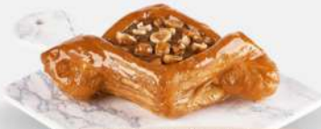
Hazelnut & Nutella Danish Pastry

Sweet, warm, cinnamon-infused bun with indulgent fondue center.