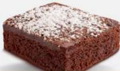
Classic Chocolate Brownie

Rich walnut-caramel brownie layers embrace decadent sweetness in a tempting sandwich.