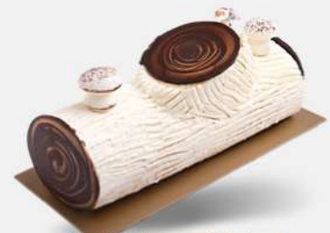
Vanilla Irish Crème Yule Log

Rich almond sponge, luscious chocolate layers, festive Yule Log delight.