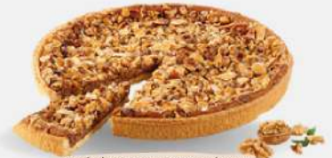
English Nut & Caramel Tart

Sweet blueberry jam swirls in flaky tart crust, a luscious delight that captivates taste buds.