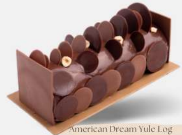
American Dream Yule Log

Hazelnut Sponge, Dark Chocolate Mousse, Chocolate Creux.