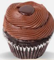
Chocolate Creme' CupCake

Moist chocolate base, creamy Oreo-infused frosting, topped with a tempting cookie crumble.