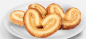
Palmier Sugar Heart

Flaky danish filled with sweet cherry marmalade, a delightful pastry.