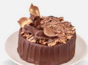
Nut Chocolate Bento Cake

Decadent layers: chocolate, hazelnut, moist cake, a delightful bento treat.