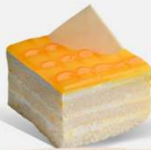
Qube Chocolate Framboise

Decadent caramel-infused cake, rich, moist, and irresistibly indulgent delight.