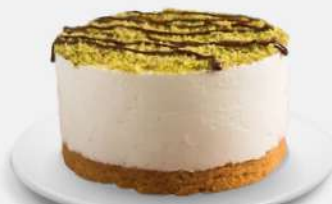
Kunafa Cheese Cake

Delicious Middle Eastern pastry with date filling and delicate crust.