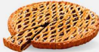
Blueberry Jam Pie

fruit & nut tart: buttery crust, luscious fruits, crunchy nuts, a sweet symphony in every bite.