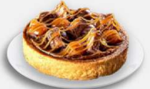
Mars Chocolate Tart

Mango tart: buttery crust, luscious filling, tropical indulgence in every bite.