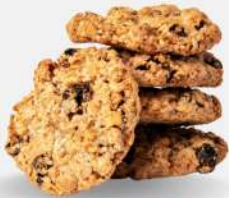
Peanut Butter Cookie

Crunchy, chocolaty bites of bliss, the perfect brownie chip delight.