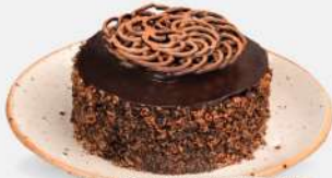
Brownie Fudge Bento Cake

Biscoff bliss: layered cake, caramel swirls, crunchy bites, sweet perfection.