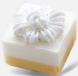
Qube Crème du Caramel

Intense Qube Fraise Qake: frantic gameplay, vibrant visuals, strawberry chaos.