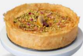
Baklava Cheese Cake

Sweet pastry delight, layers of dough, cream, nuts, and syrup.