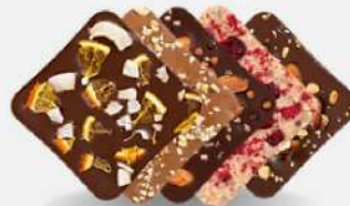
Chocolate Entremet Bars

Small, sweet, red fruit; chewy texture; often dried for snacks.