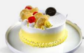
Pineapple Bento Cake

caramel crunch bento cake sweet, textured, irresistible indulgence awaits.