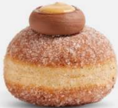
Sea Salt Caramel

Salt & Sugar Crust, Milk Chocolate, Caramel Topping