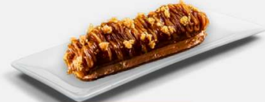
Swiss Chocolate Butterscotch Eclairs

Eclairs filled with Lotus Biscoff, a caramelized spiced cookie.