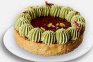
Pistachio Berry Tart

Crunchy caramel, nuts embrace in a delectable, golden pastry delight.