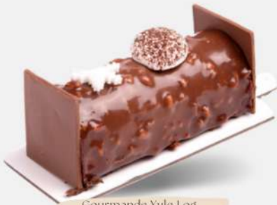
Gourmande Yule Log

Yule Log embodies the American Dream with sweet elegance.