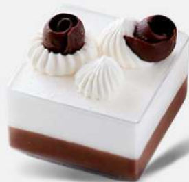
Qube Forêt noire

Luscious mango-infused cake with Qube's signature creaminess, pure dessert bliss.