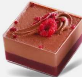
Qube Chocolate Framboise

Decadent caramel-flavored cake with a luscious qube twist.