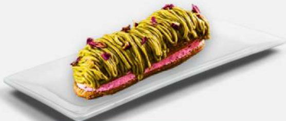
Pistachio Berry Eclairs

Swiss chocolate, butterscotch-filled eclairs, a luscious indulgence awaits.