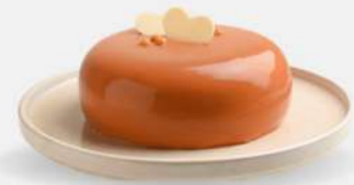
Salted Caramel Bento Cake

Black Forest Bento Cake Cherries, chocolate, layers; irresistible indulgence.