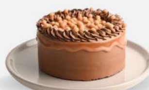
Caramel Crunch Bento Cake

Blueberry Bento Cake Sweet, fruity layers embrace delightful culinary artistry.