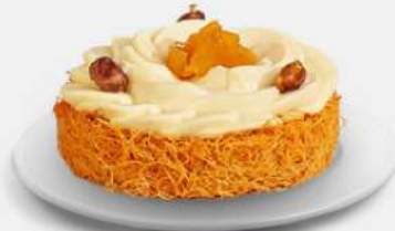
Mango Cheese Kunafa Tart

Sweet and crunchy kunafa with a fruity twist, a delightful treat.