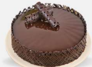
Vienna Truffle Cake

Spongy cake infused with cardamom, saffron, and creamy rasmalai essence.