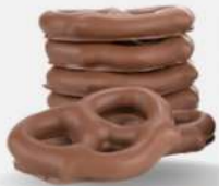
Milk Chocolate Pretzel

Sweet, salty blend milk chocolate embraces crunchy pretzel perfection.