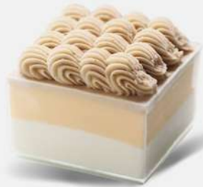
Qube Caramel au Beurre

Raspberry-infused delight: Qube Framboise qake, sweet, moist, irresistible indulgence.