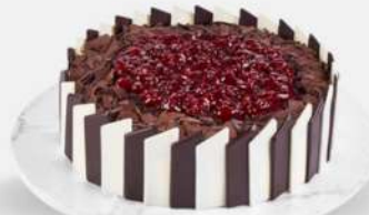
German Black Forest

Coconut-infused delight with pineapple, rum, and creamy frosting paradise.