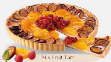
Mix Fruit Tart

Buttery crust, luscious custard, adorned with fresh strawberries pure indulgence in every bite.