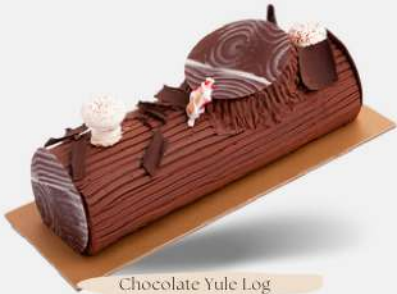
Chocolate Yule Log

Chocolate Cream, Biscotto praline, whipped cream and caramel cookie crumble