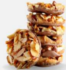
Almond Chocolate Florentine

Delicate pistachio lace cookies, crispy, nutty, and irresistibly sweet treats.