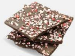
Nut Chocolate Bark

Rich dark chocolate embraces zesty orange peel, a decadent fusion.