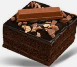
Qube Caramel au Beurre

Qube Framboise Qake: sweet, moist, indulgent perfection.