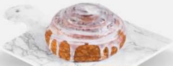
Cinnamon Fondue Bun

cinnamon fondue bun: warm, gooey, aromatic bliss in every bite.