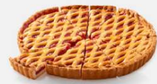
Strawberry & Jam Pie

lemon tart with buttery crust, a citrusy symphony, sweet and tangy perfection in every bite.