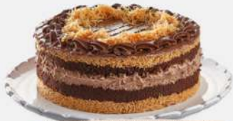
Chocolate Truffle Kunafa Cake

Decadent pastry layers filled with chocolate and crunchy walnuts delight.