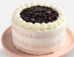
Blueberry Bento Cake

Salted caramel bliss, bento cake perfection in every bite.