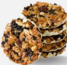
Cranola & Berry Cookie

Delicate cookies adorned with intricate royal icing designs, visually captivating treats.