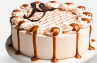
Alpenlibe Butter Toffee

Dark chocolate layers, cherries, whipped cream.