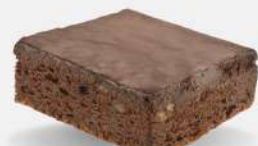
Chocolate Fudge walnut Brownie

Decadent American brownie infused with zesty orange essence, pure indulgence.