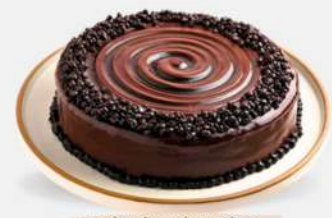
Triple Chocolate Chip

Rich, moist butterscotch cake with caramelized sweetness and decadent layers.