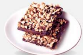
Almond Brittle Chocolate

entremet bars: luscious layers, exquisite flavors, pure indulgence.