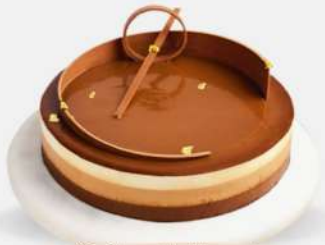
Tri Chocolate Mousse'

layers of dark, milk, white mousse perfection.