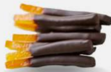
Chocolate Orange Peel

Decadent layers blend dark, milk, white in heavenly mousse cake.