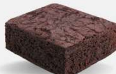
American Brownie With Orange Zest

Rich, fudgy, decadent chocolate brownies: pure indulgence in every bite.