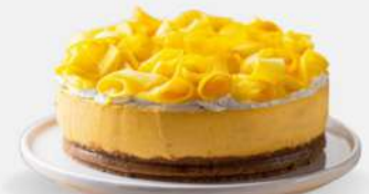
Fresh Mango Cheesecake

Baked cheese cake made with cream Cheese ,Sugar cooked and topped with Crumble.