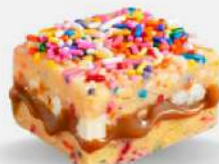
Blonde Cookie Dough & Caramel Sandwich

Decadent brownie layers with rich double chocolate, caramel, and chips.