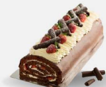
Chocolate Strawberry Yule

Decadent Yule Log with rich vanilla Irish cream swirls.