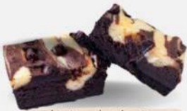
Cookie Dough Chip Bar

Rich cocoa embraces salty pretzel for a decadent, indulgent delight.