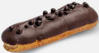
Dark Choco Chip

Decadent choux pastry filled with caramel, toffee, and luscious cream.