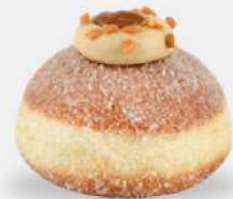
Dolce fleur de Sel

Sweet, fluffy donut oozing with luscious strawberry jam filling delight.