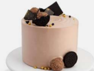
Tall Boy Chocolate Cream

Tall Boy Pineapple Gateau: Layers of moist cake, pineapple perfection.