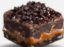
Salted Caramel Chocolate Overload Brownie sandwich

Brownie filled with peanut caramel and cookie goodness, irresistible indulgence.