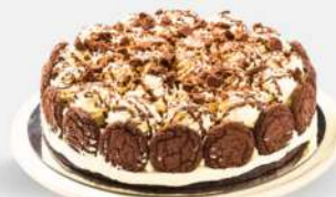
Cookie Crumble Cheesecake

Hazelnut-caramel cheesecake rich, creamy indulgence with nutty