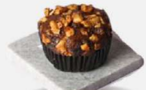
Chocolate walnut Muffin

Moist muffin with rich chocolate chips, a delightful indulgence.