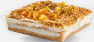
Mango Cookie Kunafa

Sweet, flaky pastry with cherries, lotus spread; a delightful treat.