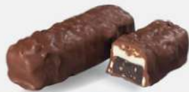
Caramel Chocolate Bar

Crunchy almond brittle enrobed in rich, smooth dark delight.