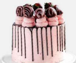
Tall Boy Strawberry

Decadent layers, rich chocolate, velvety cream; a tall, indulgent delight.