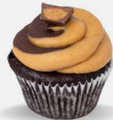
Coffee Caramel CupCake

luscious creme filling, topped with velvety frosting, a blissful indulgence.